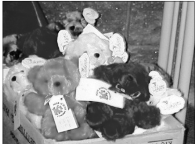
Teddy Bears donated by "Hugs Across America" were given to each child who visited