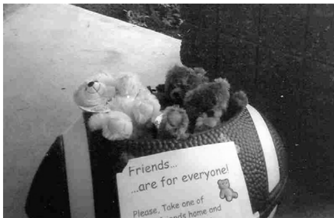
Children are invited to take home "a friend"

Foster's Daily Democrat arrived to cover the event about the same time as the "Balloon Lady". To read coverage of the event you may go to www.Fosters.com and check the article dated August 3, 2006. The article is entitled, "Family Members of Strafford County Jail Inmates Treated to BBQ".