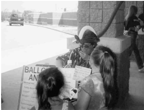
The "Balloon Lady" delights the children