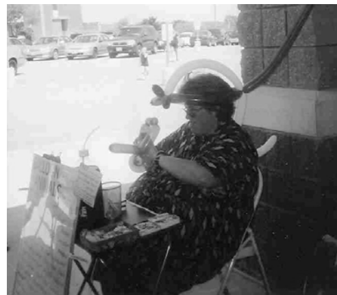
The "Balloon Lady" works on a creation.